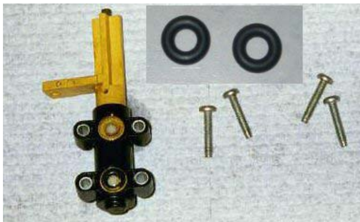
Fuel Filter Housing Drain Valve removed (New Rings on top)

Like any other products we cannot be held liable for incorrect installation. Installation of performance enhancing products is solely at your own risk. Check your local emissions laws prior to installation. Except in cases of gross negligence the buyer holds us harmless.